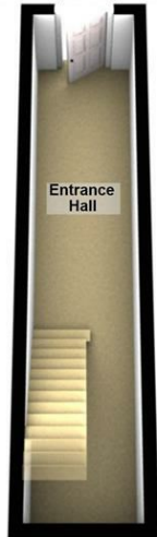
Ground Floor Approx. 13.1 sq. metres (141.3 sq. feet)